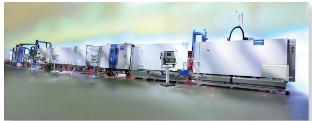
Bystronic first flexspacer line

In total, the production line took only three weeks to install. Edgetech had a hand in the selection and