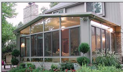
Barracuda Mfg. makes Super Spacer IG for TEMO Sunrooms, one of the world's largest manufacturers of sun rooms, solariums and patio enclosures.