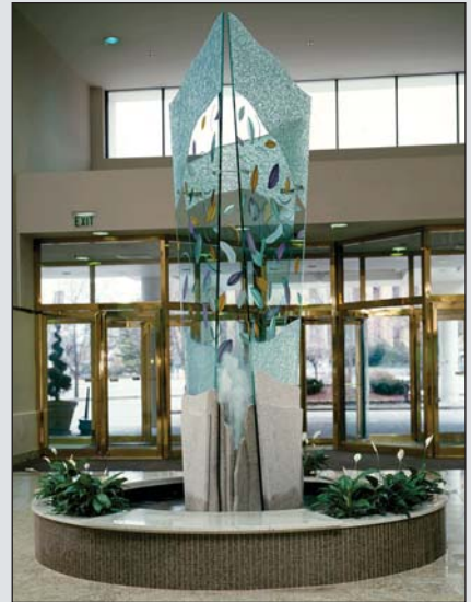
While its sister division markets IG for the window industry, Glass and Mirror Craft fabricates architectural glass and one-of-a-kind studio pieces for residential and commercial customers across the U.S.